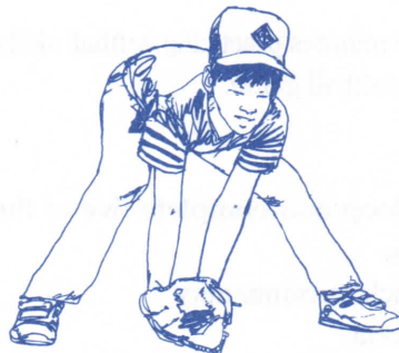
Catching a ground ball