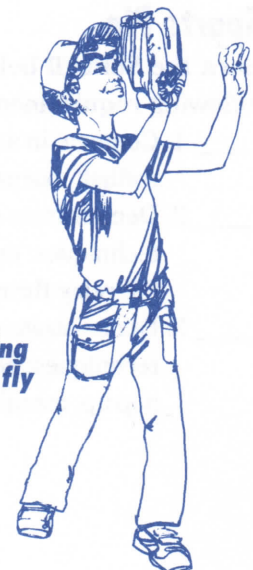
Catching a pop fly